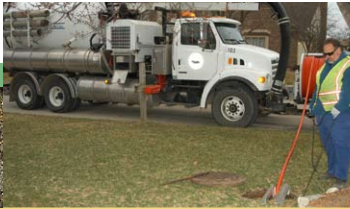
FOG build-up in sewer pipes (shown below) is costly to clean requiring local public works staff to go to the site and remove the blockage (shown above).